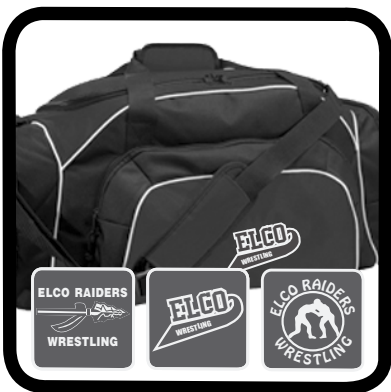
ITEM 11: Holloway Sport Bag. Color: Navy/Black/White Name Embroidered on End Pocket 21" x 11" ... $29.50 L Side Pocket