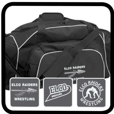
ITEM 10: Holloway Sport Bag. Color: Navy/Black/White Name Embroidered on end pocket. 28" x 13" ... $34.50 L Side Pocket